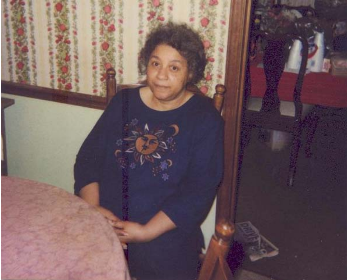
My Mother(Mi Madre)